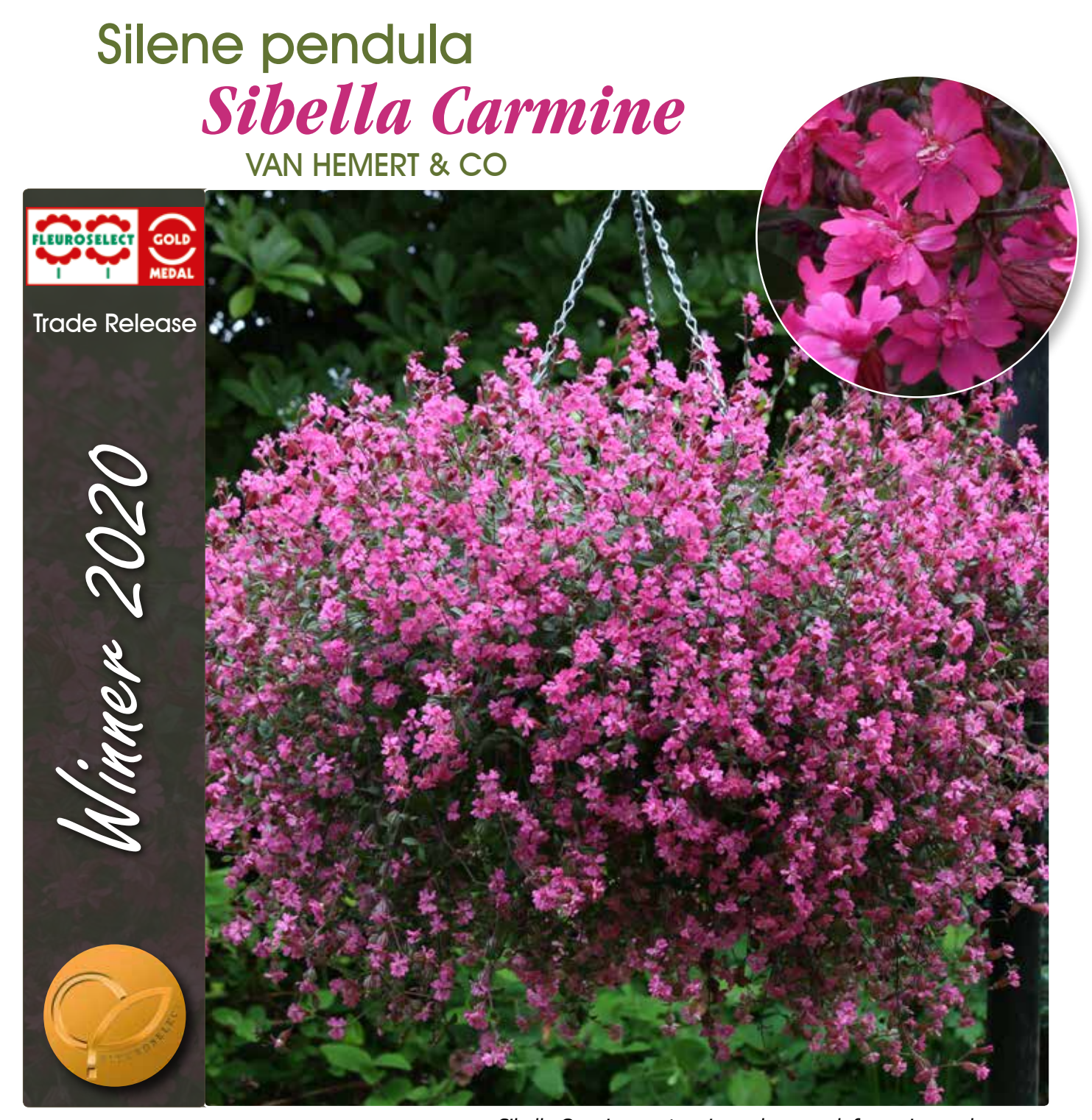
Sibella Carmine, a stunning colour spark for spring and summer

Looking for a vibrant colour blotch to brighten up your garden? Get acquainted with Sibella Carmine! This brand new Silena pendula is a multifunctional colour blast for pots, containers and bedding. Sibella makes large plants that are just perfect for baskets and containers in spring or ideal as an all-round bedding and terrace plant in summer. The plants are self-cleaning, flowers do not scatter and no deadheading is needed.